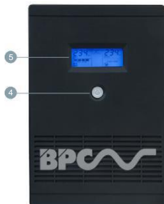
PSTARX 1000E & 2000E Models